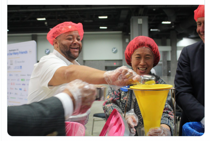
2:07 PM · Sep 12, 2023 · 650 Views

#Shareworthy: In honor of @911Day of Service and Remembrance volunteers came together across the country to pack more than 6.5 million meals to address hunger in their communities. Read more about our #911Day efforts: Bit.ly/911Day23